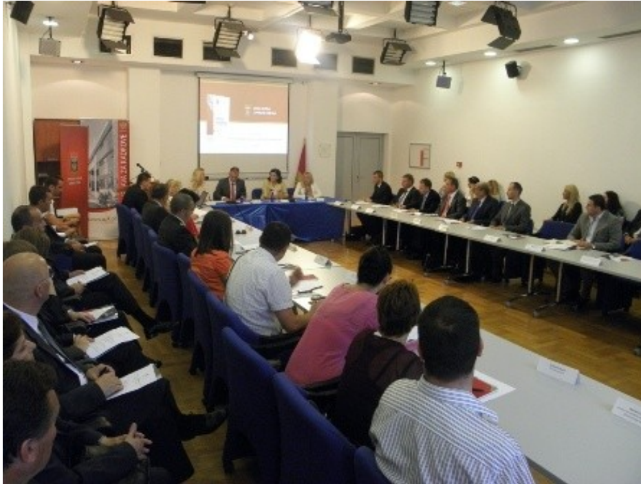
Promotion of the Code of Ethics for customs officials