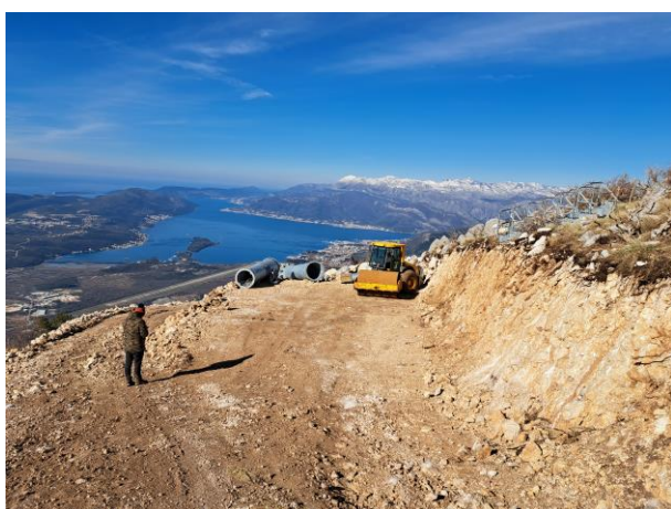
Towers S14 and S15