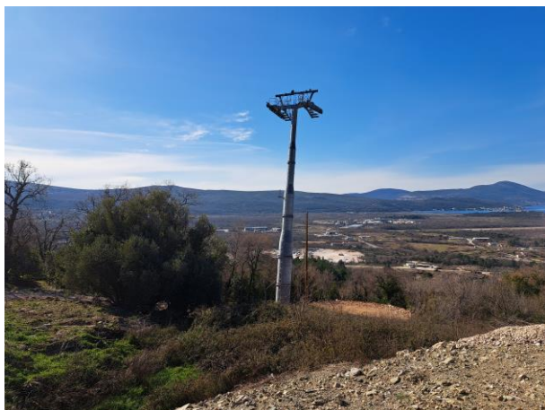
Towers S4 and S6