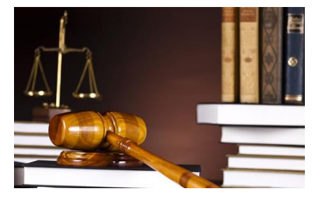
Course level: Intermediate level