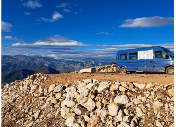
Towers S14 and S15