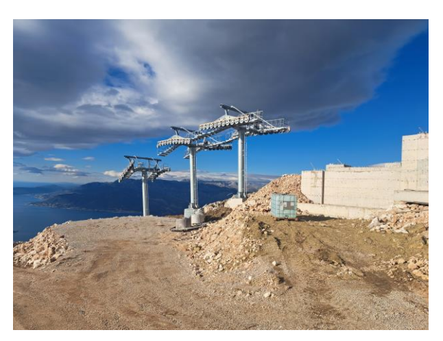
Tower W16 and towers S17 to S19