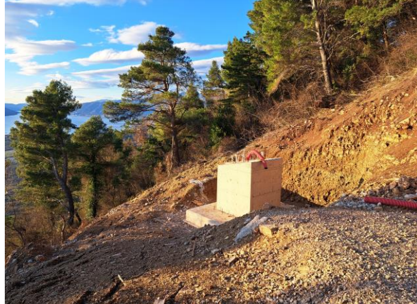
Towers S5 and S6