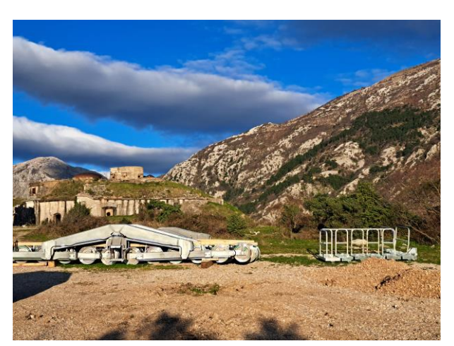
Towers S7 and S8