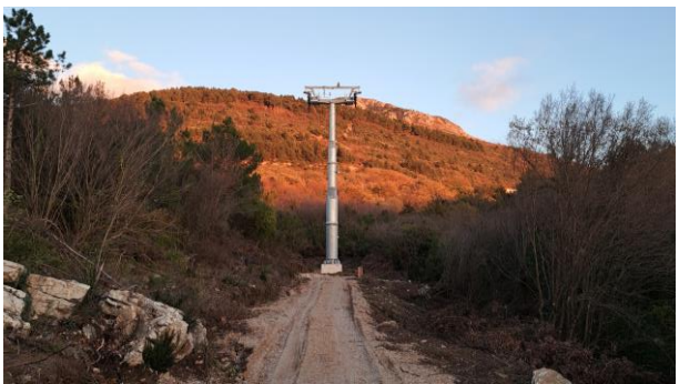
Towers S2 and W3