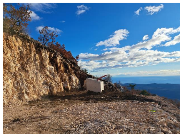
Towers S12 and S13

WEEKLY REPORT CW 02 INDEPENDENT ENGINEER 14/15