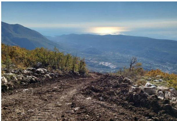
Preparation of the approach to S12