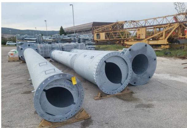
Delivery of components in the storage area