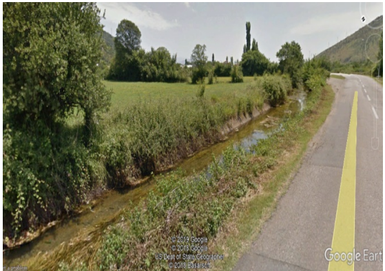
The Mareza near the road and within the Protected Area