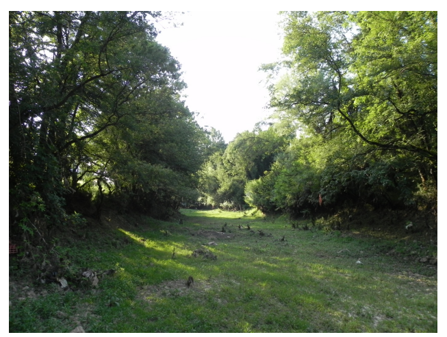
92Ao - Salix alba and Populus alba galleries (Sušica River