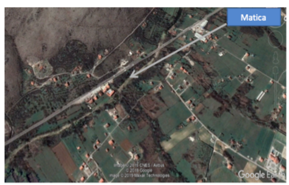
Figure 1 -NATURA 2000 habitat along Susica River