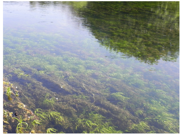
Watercourse with Ranunculion fluitantis and Callitricho- Batrachion (Komanski bridge)