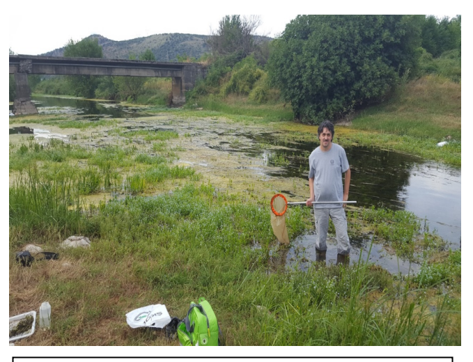
Sampling at Komanski Most site, Sitnica River

As described in the previous plan, the rivers are of note for Endemic freshwater snails recorded around the Komanski bridge including Valvata montenegrina (EN); Radix skutaris (EN); Stagnicola montenegrinus (NT); Viviparus mamillatus (DD) and Bithynia radomani (LC)