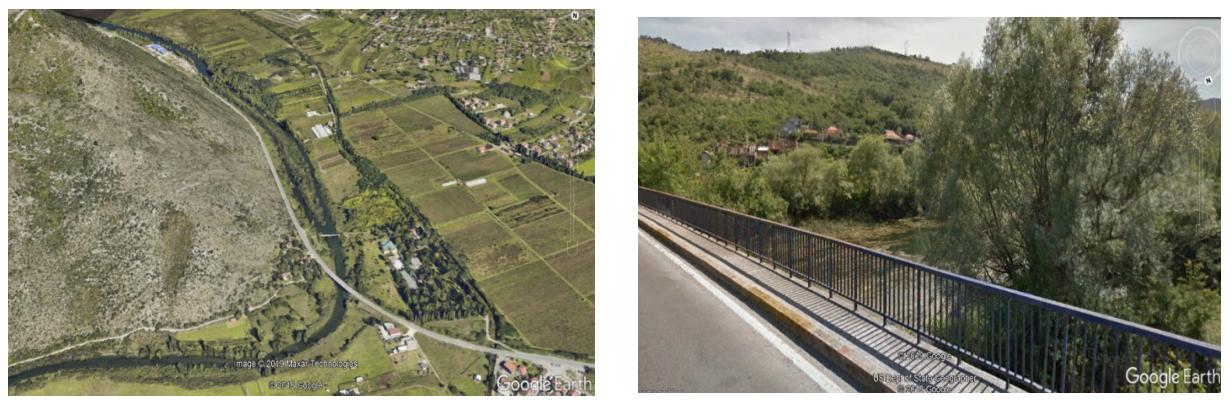
This river is crossed by the scheme below Cafa and the road then runs alongside the river to Podgorica.

The River Sitnica is a tributary of the Morača but whilst the Matica and Moraca flow year round the Sitnica (at Komanski Most) is an intermittent river that can dry up in the summer months.