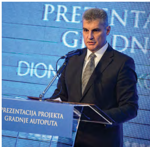
Ivan Brajović, ministar saobraćaja i pomorstva

- Od ukupne cijene, za projektovanje i izgradnju prioritete dionice auto-puta Smokovac-Uvač-Mateševo, 85 odsto sredstava biće obezbijeđeno iz kredita EXIM banke, a preostalih 15 odsto obezbjeđuje naša država. Rok otplate je 20 godina, grejs period 6, a godišnja kamatna stopa 2 odsto. Zaista mislim da se bolji finansijski uslovi, u sadašnjim trendovima na globalnom tržištu kapitala, nijesu mogli obezbijediti, rekao je Brajović