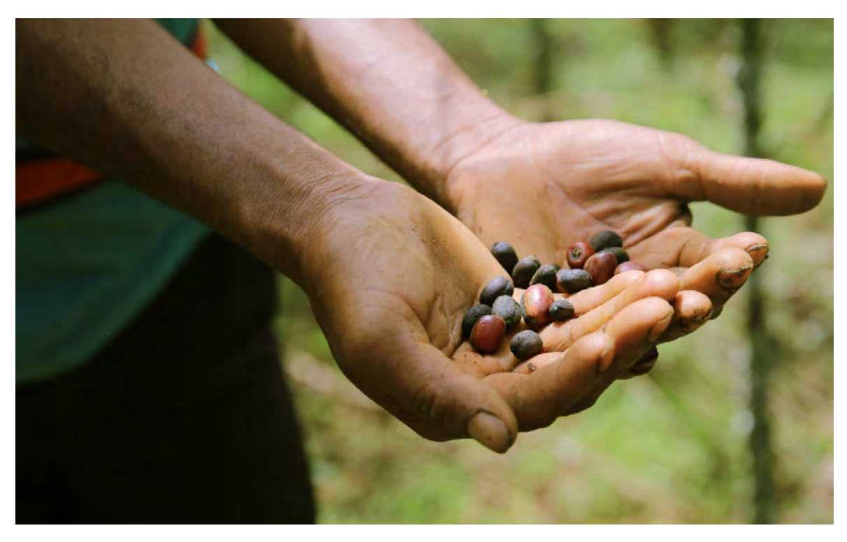
A farmer from the Oromia Coffee Farmers' Cooperative Union Jimma, Oromia, Ethiopia, shows the effect of climate change on normally bright-red coffee cherries, now damaged and burned.