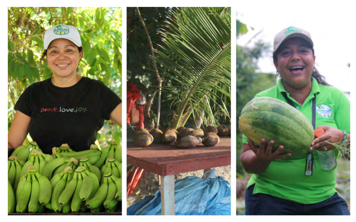
Banelino in the Dominican Republic is intercropping bananas with other fruits such as coconuts and papayas to build resilience and diversify income streams.

What's more, the crisis has undermined the ability of many small farmer associations to invest in productive capacities and to attract external investments for modernization.