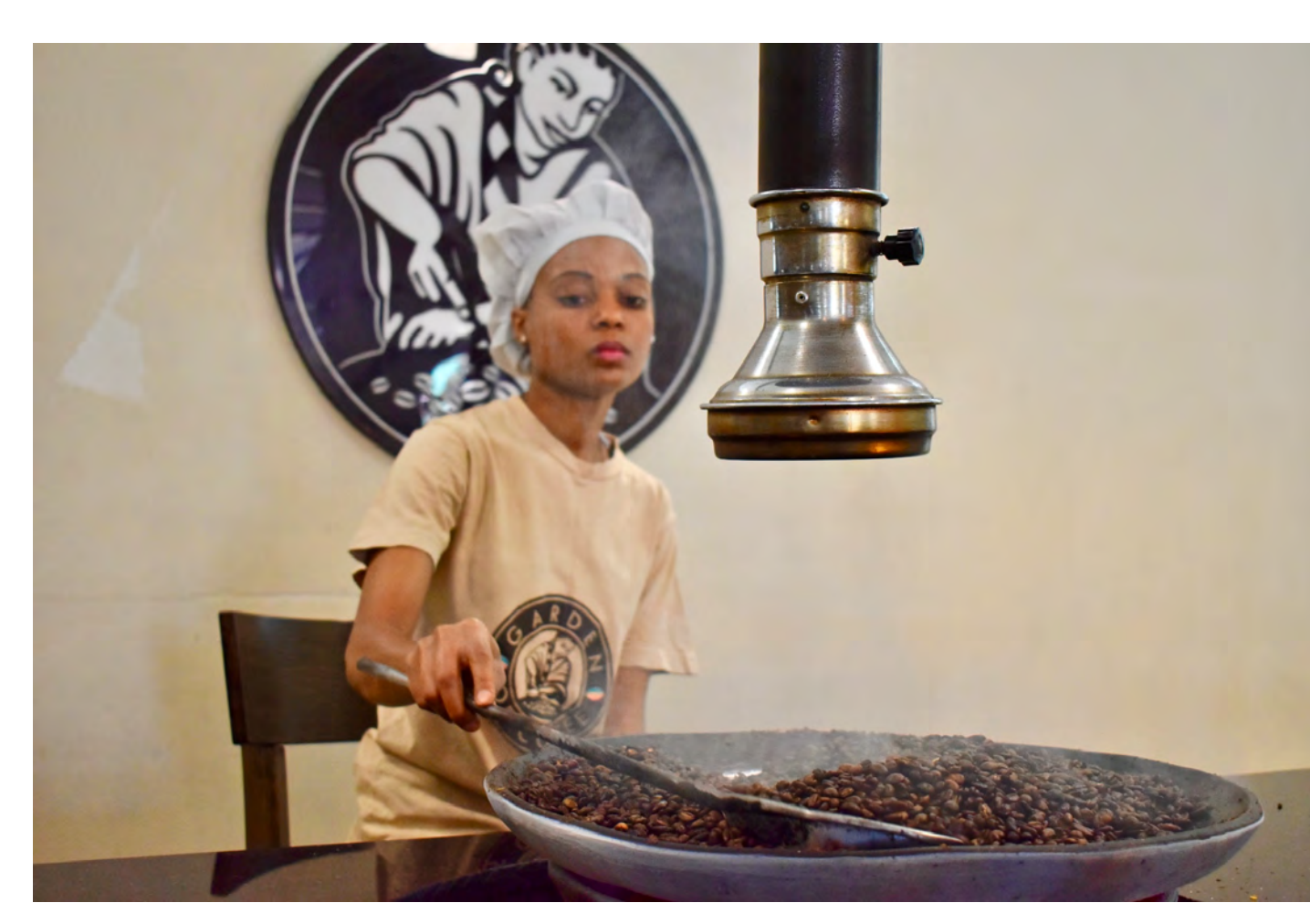
Adding value, selling locally: A worker roasts coffee the traditional way at <u>Garden of Coffee</u> in Addis Ababa, Ethiopia. The specialty-grade coffee is packaged and sold to domestic and international markets.