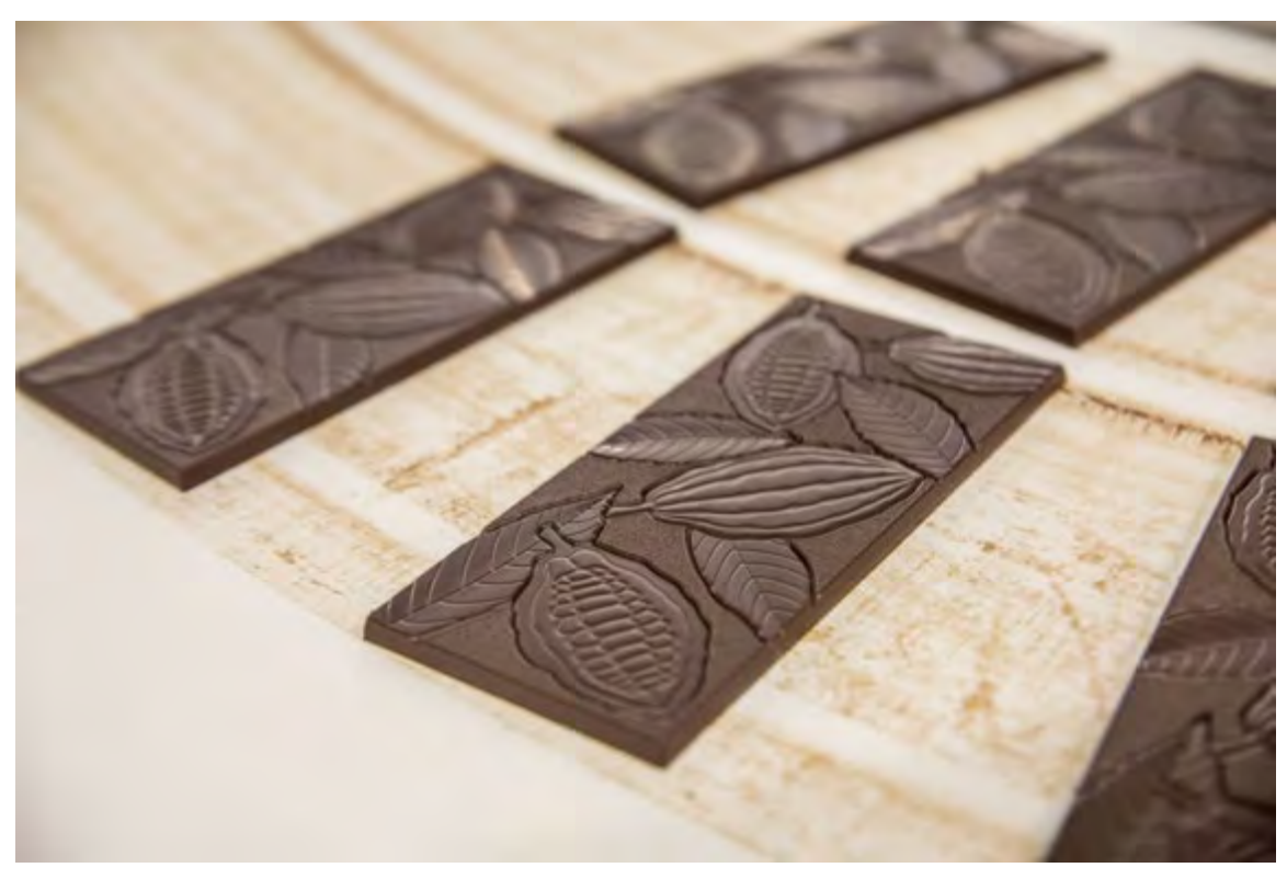
Swiss chocolate manufacturer Chocolats Halba uses a bean-to-bar process and supports its cocoa suppliers on sustainability issues.

Their answers help us understand what small farmers are going through – and what is yet to come.