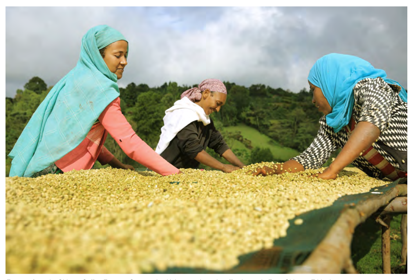
Farmers from the Sidama Coffee Farmers Cooperative Union sort through coffee beans in Fero, Sidama, Ethiopia.

It is time to ask how they have been affected. What are their coping strategies? What support do they need to keep going – and, eventually, to recover while improving their livelihoods and