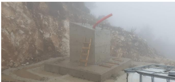
Tower S13 foundation