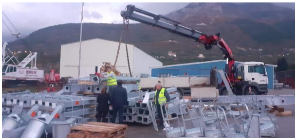
Delivery of components in the storage area