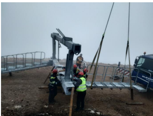
Assembly of the tower S19