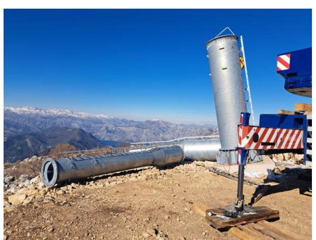
Towers S14 and S15