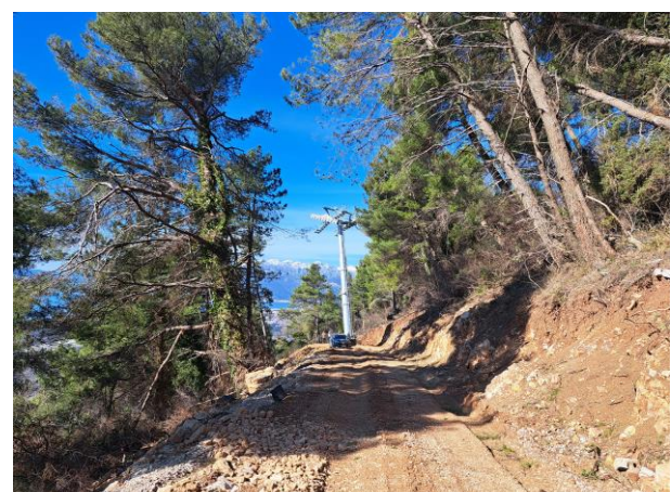
Towers S4 and S6