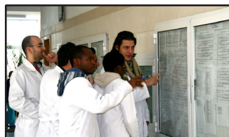
Foreign students secretary

The Faculty of Medicine of Constanta introduced, among the first in Romania, the system of transferable credits (ECTS), thus facilitating the mobility of students from one university to another.