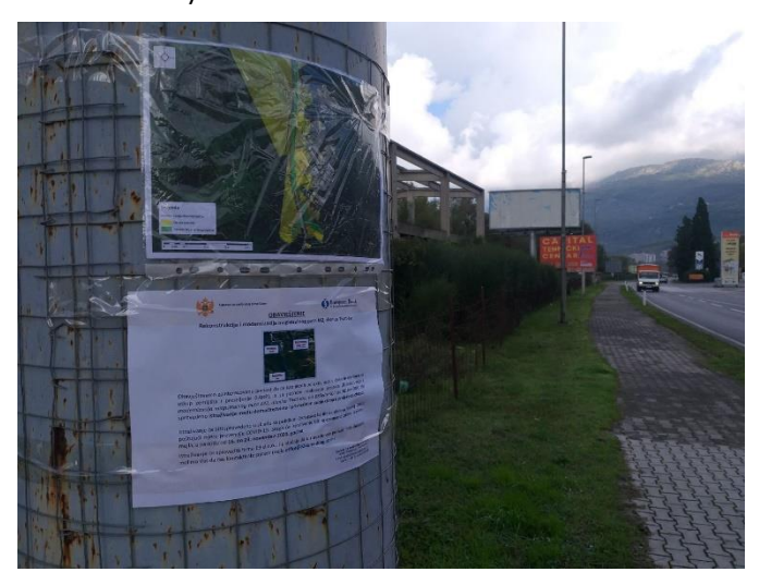
Figure 3: example map disclosure

In November 2020, a second survey was carried out in the same target area (the 50-metre corridor either side of the existing road) gathering a sample of asset inventory and livelihood details to provide the current LARP document with a representative sample informing the entitlements and resettlement budget, particularly given the REA process of collecting a full census and inventory is still underway.