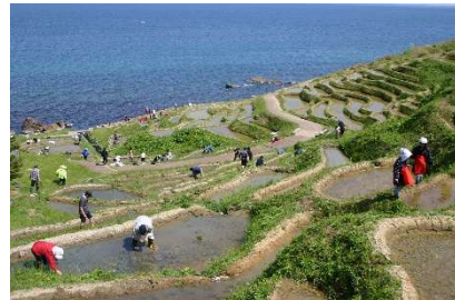
Satoyama and Satoumi concept has been developed in Japan that aims for harmonized co-existence of people's livelihoods and nature.

Japan has accumulated substantial experience in this field through its environmental policies, institutional systems, and local development practices. A representative example is Noto's Satoyama and Satoumi in the Hokuriku region, which has been designated as a Globally Important Agricultural Heritage System (GIAHS). The area demonstrates integrated environmental, economic, and social improvement through sustainable natural resource management, including efforts to strengthen local resilience and recovery following the earthquake in 2024.